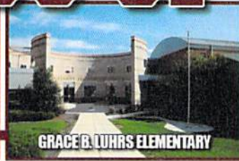
GRACE B. LUHRS ELEMENTARY